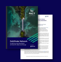
Data exchange specifications enabling connection between tech solutions